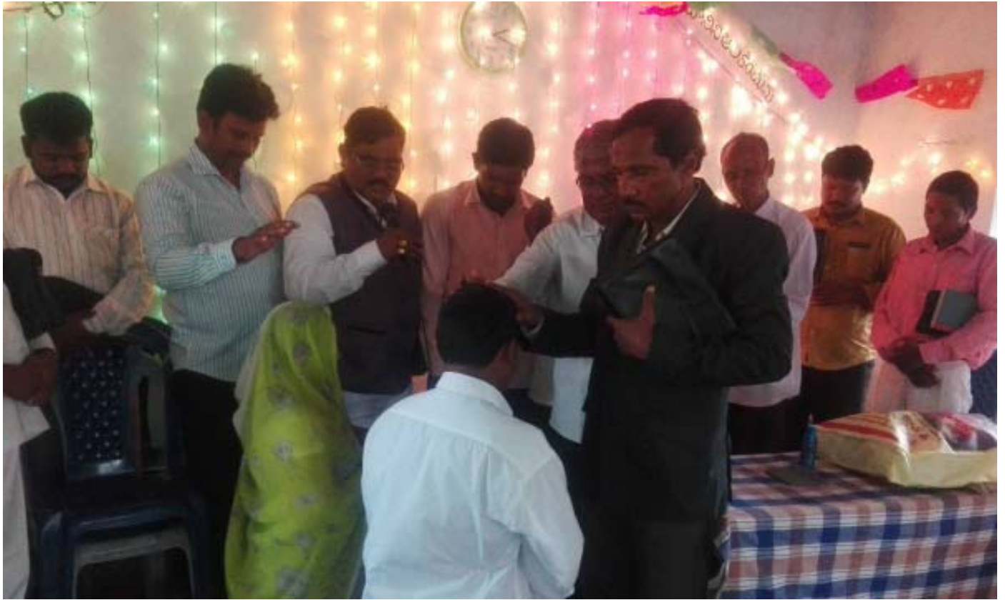
Above: An anointing service. Below: More praise and worship time.