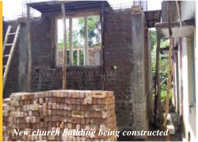
New church building being constructed

Our faith in God is based on the knowledge of our Lord Jesus Christ, as John 1:18 says, “No man hath seen God at any time; the only begotten Son, which is in the bosom of the Father, he hath declared him .”