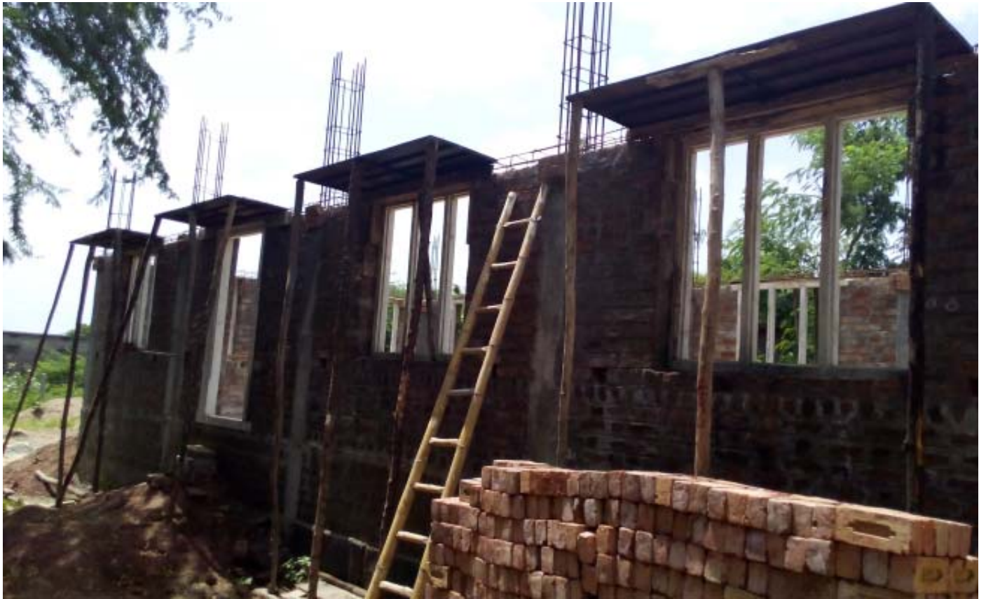
Different stages of the construction of the new church.