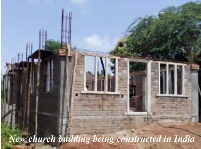
New church building being constructed in India