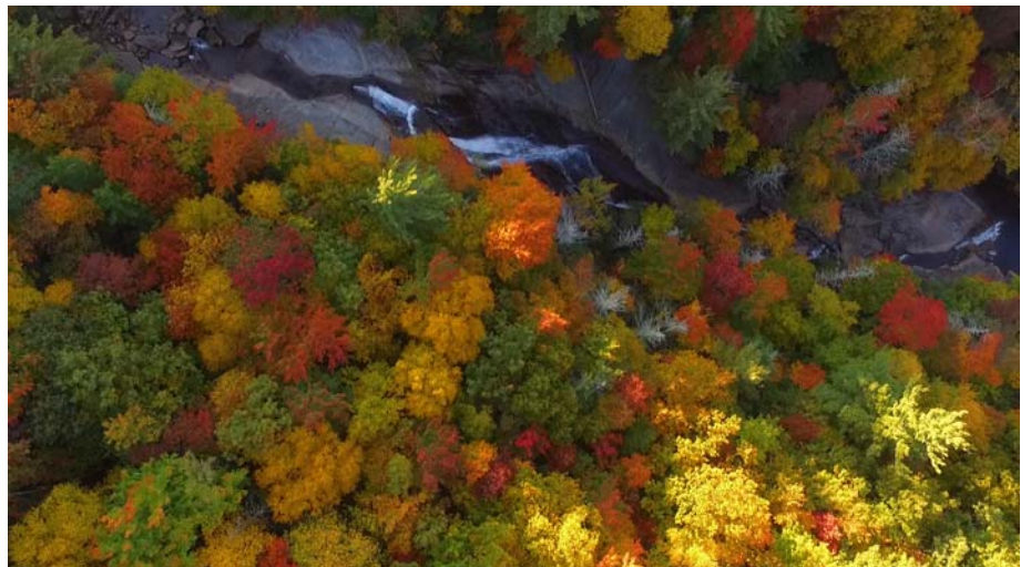
Pictures on cover and below of Upper Creek Falls in North Carolina

"And by the river upon the bank thereof, on this side and on that side, shall grow all trees for meat, whose leaf shall not fade, neither shall the fruit thereof be consumed: it shall bring forth new fruit according to his months, because their waters they issued out of the sanctuary: and the fruit thereof shall be for meat, and the leaf thereof for medicine" (Ezekiel 47:12).