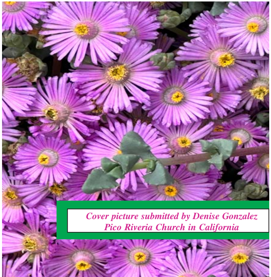
Cover picture submitted by Denise Gonzalez Pico Rivera Church in California

Volume LXXIII Number 12 May 2025 The Advocate of Truth USPS 542-940