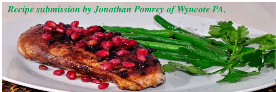
Recipe submission by Jonathan Pomrey of Wyncote PA.

Stir pomegranate juice mixture; add to skillet. Bring to a boil; simmer 2 minutes, stirring constantly. Season with salt and pepper. Spoon sauce over chicken and sprinkle pomegranate seeds on top. Serve with rice and steamed vegetables, if desired. Makes 4 to 6 servings.