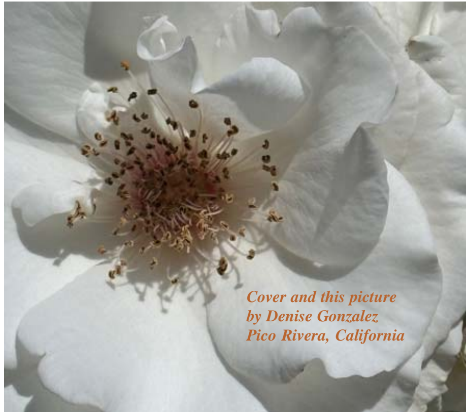
Cover and this picture by Denise Gonzalez Pico Rivera, California

"I will instruct thee and teach thee in the way which thou shalt go: I will guide thee with mine eye" (Psalm 32:8).