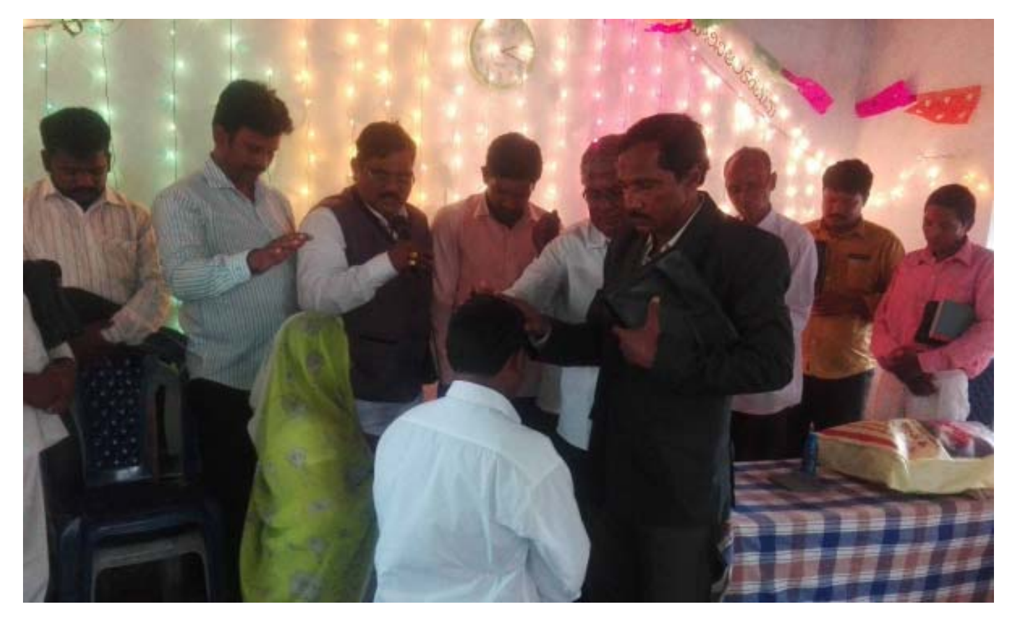
Above: An anointing sevice. Below: More praise and worship time.