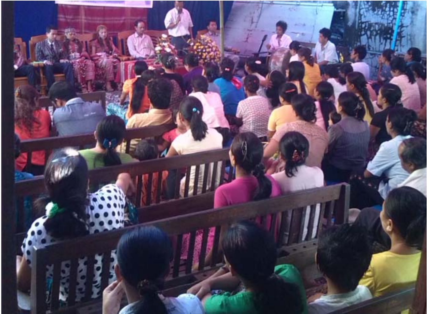
The wedding ceremony (above). The happy couple (below). The congregation enjoying a meal.