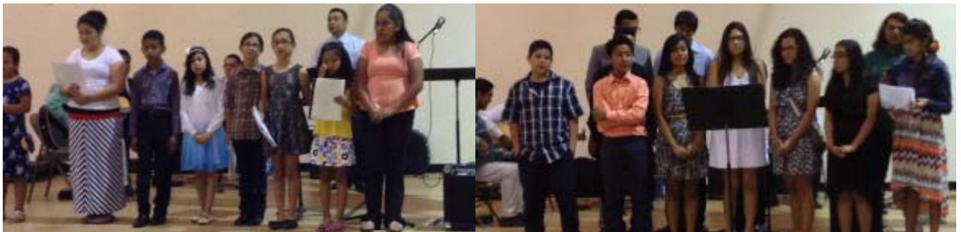
Youth groups giving specials during the Sabbath service.