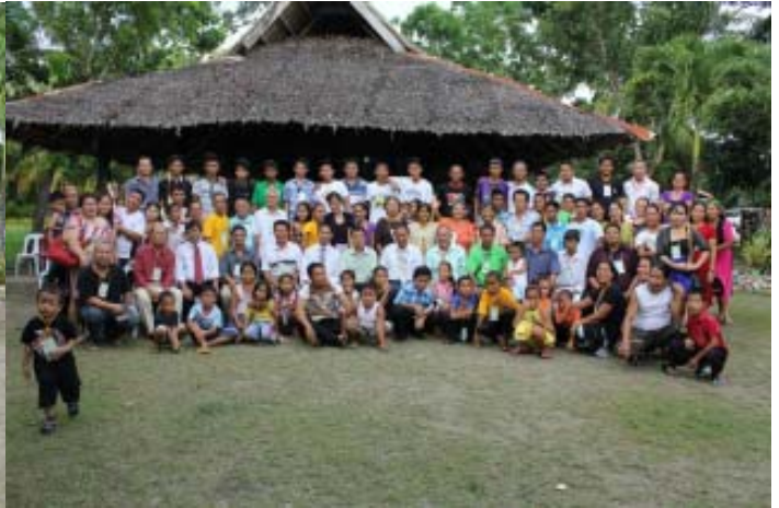
and Bogayo, Kumalarang, Zamboanga Del N.