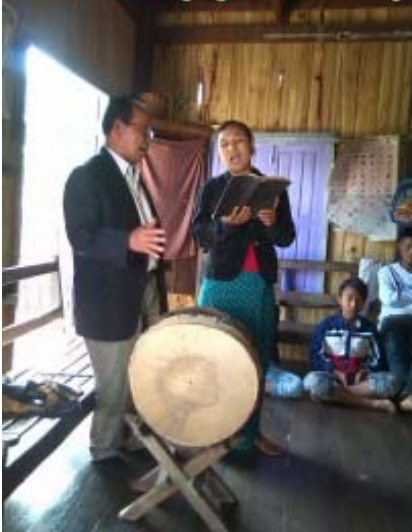
Elder & wife singing on sabbath day