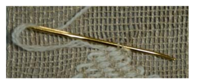
New Cloth on an Old Garment