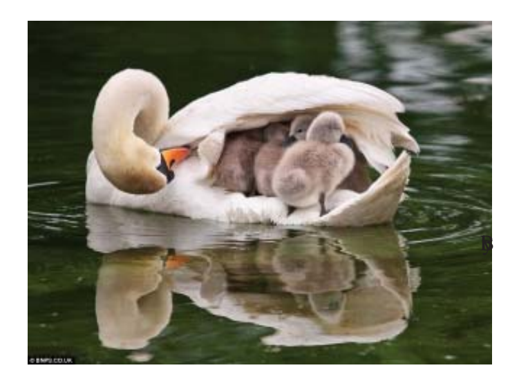
By: Audrey O'Connor

Instinct is a word often heard when people speak of sometimes unbelievable things animals do. It is supposed to be a knowledge which all animals have at birth, which tells them that certain things must be done, and certain other things must not be done. Too many times we just say, "That is instinctive," when an animal's actions seem to show more cleverness than we feel he should have. If we were to watch animals with their babies some day, we might change our minds about so many things being "instinctive."