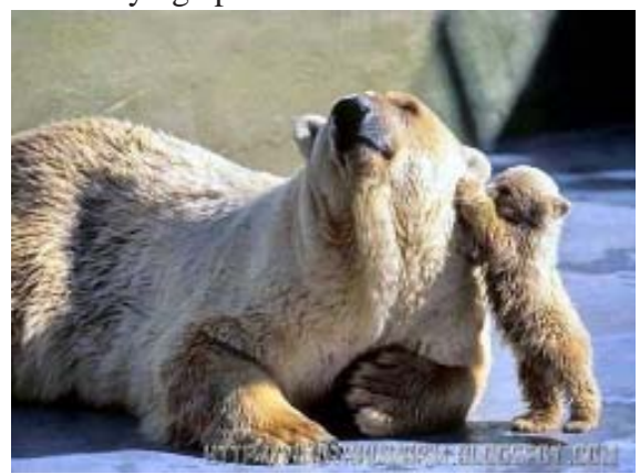
HOW MOTHER'S DAY STARTED

Mother's Day is held the second Sunday in May.