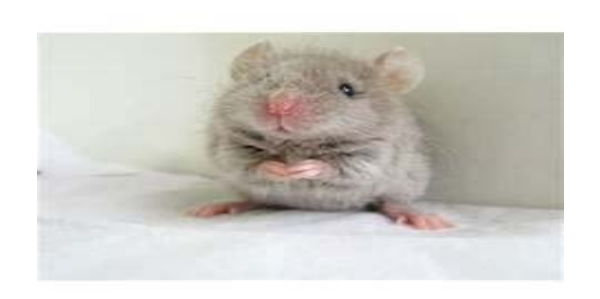
BIBLE ANIMALS Unscramble these Bible names