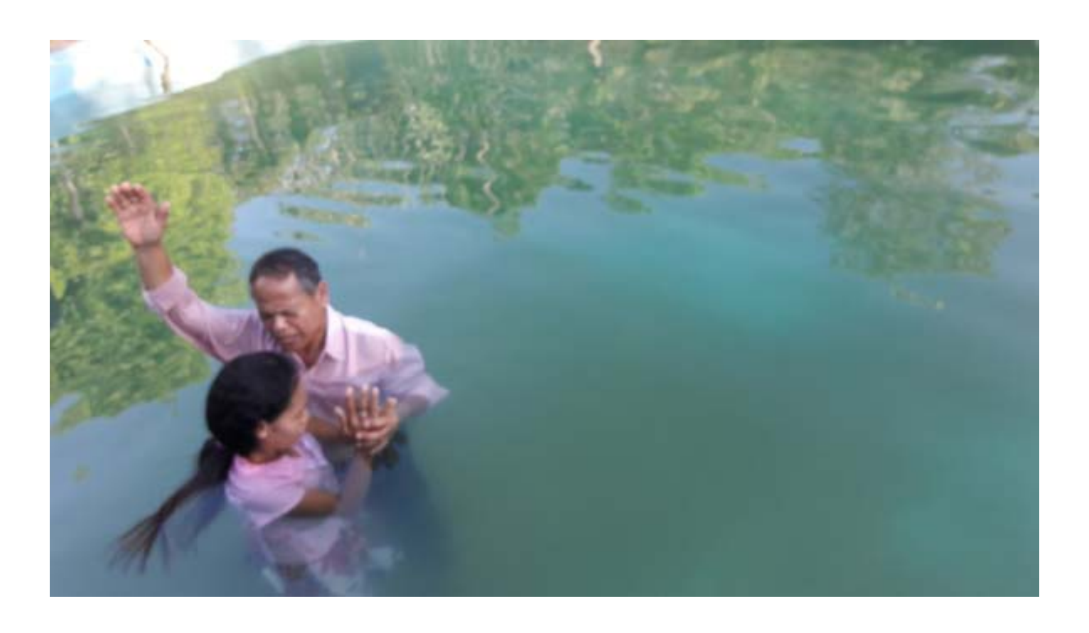
Precious souls being placed into the watery grave of Baptism.