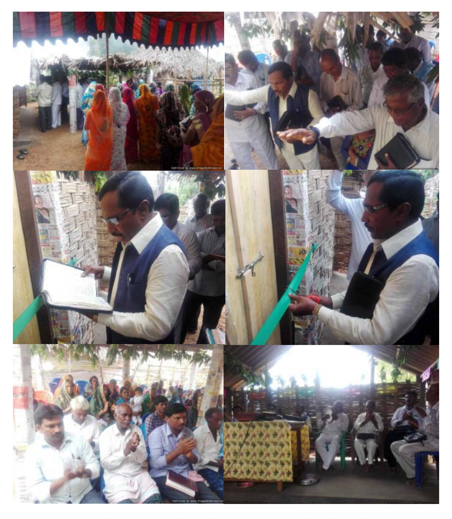
Dedicating, and worshipping inside, the church.