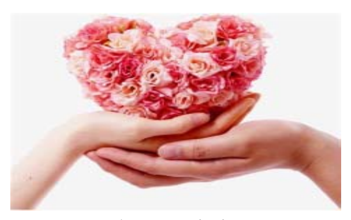
A Rose Within Author Unknown

A certain man planted a rose bush and watered it faithfully, and before it blossomed, he examined it. He saw the bud that would soon blossom and the thorns. And he thought, "How can any beautiful flower come from a plant burdened with so many sharp thorns?" Saddened by this thought, he neglected to water the rose, and before it was ready to bloom, it died.