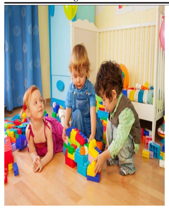
HOW THE BLOCKS WERE PUT AWAY

"Bedtime!" called Mamma. "Put the blocks away dears."