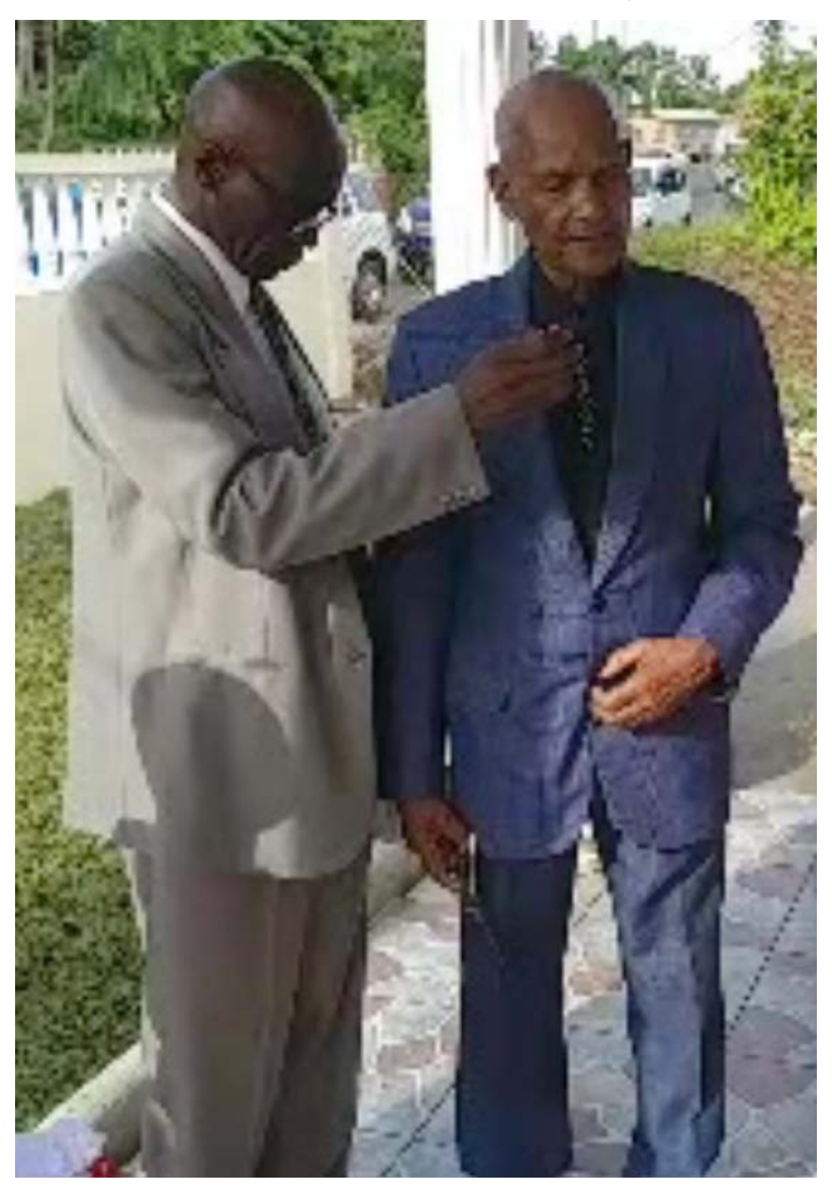
Dedication of the Church in Seamon, Grenada